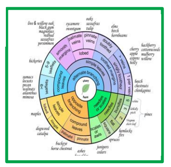
Check out CATS' new Tree ID Wheel with your smartphone now! Just scan the QR Code Above