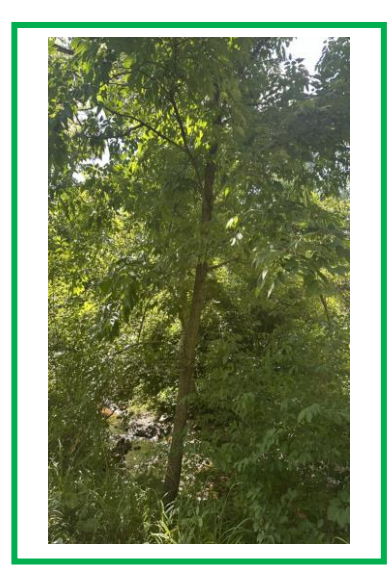
American Ash Trees require diligent care and maintenance to prevent Emerald Ash Borer infestation. Come see our tree here at Spruce Creek Park!